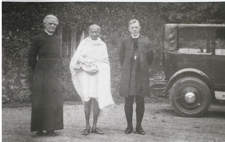
(ref: Bell 95 f. 27)

Some of the sources reflect the broader political context, for instance correspondence on the independence movement in India, including Gandhi 's visit to England for the Round Table Conference to discuss constitutional reform in India. Included is an account, with photographs, of a weekend visit to Chichester in October 1931 (ref: Bell 95 ).